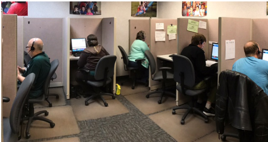
AFSCME members and retirees phone bank at Council 5's South St. Paul office to support shared sacrifice by the employer, employees and retirees to make pensions sustainable for years to come.